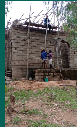
Likoma CCAP Church, Bandawe Presbytery, Malawi