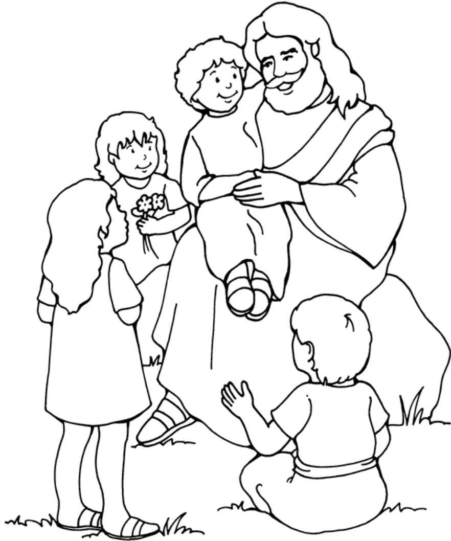
Jesus and the Children

From Thru-the-Bible Coloring Pages © 1986,1988 Standard Publishing. Used by permission. Reproducible Coloring Books may be purchased From Standard Publishing, www.standardpub.com, 1-800-543-1301.