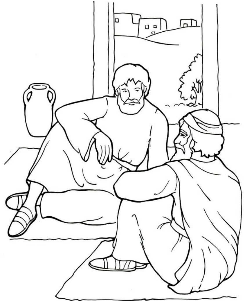
Paul learned that Jesus is God's Son.

From Thru-the-Bible Coloring Pages for Ages 4-8. © 1986, 1988 Standard Publishing. Used by permission. Reproducible Coloring Books may be purchased from Standard Publishing, www.standardpub.com , 1-800-543-1301.