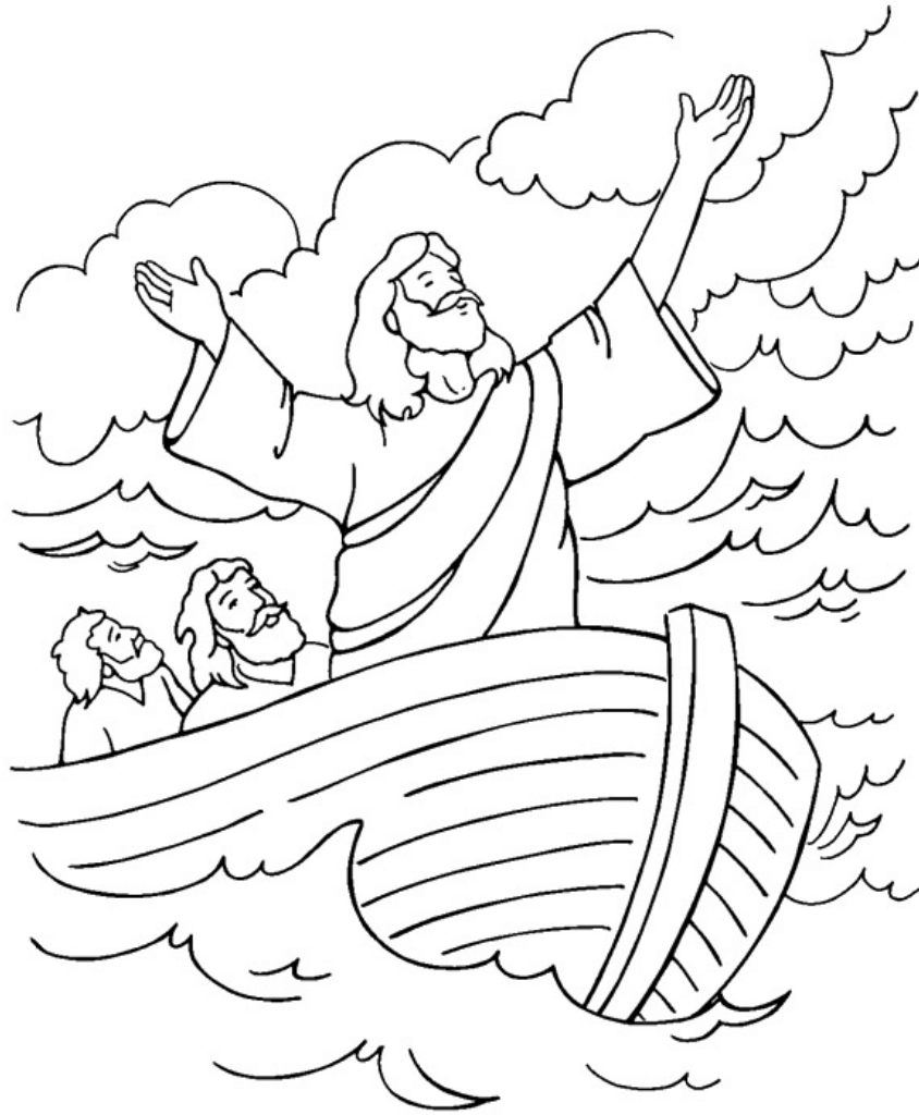
Jesus Calms the Storm

From Thru-the-Bible Coloring Pages for Ages 4-8. © Standard Publishing. Used by permission. Reproducible Coloring Books may be purchased from Standard Publishing, www.standardpub.com, 1-800-543-1301.