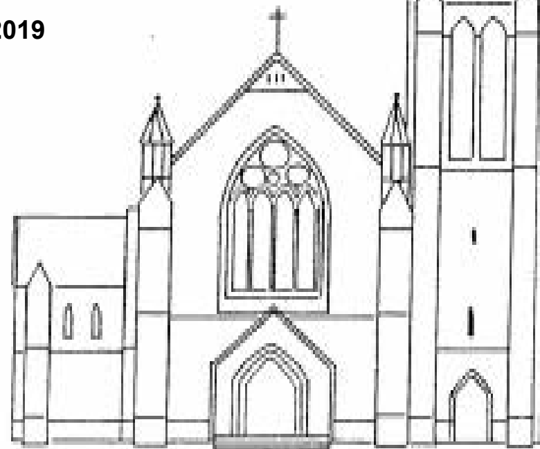
Girvan North Parish Church

Girvan North Parish Church Charity No. SC007347